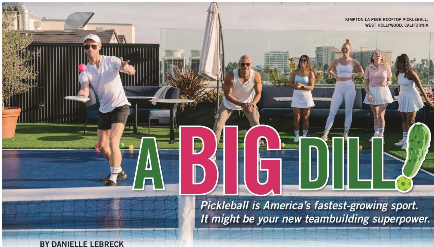
KIMPTON LA PEER ROOFTOP PICKLEBALL, WEST HOLLYWOOD, CALIFORNIA