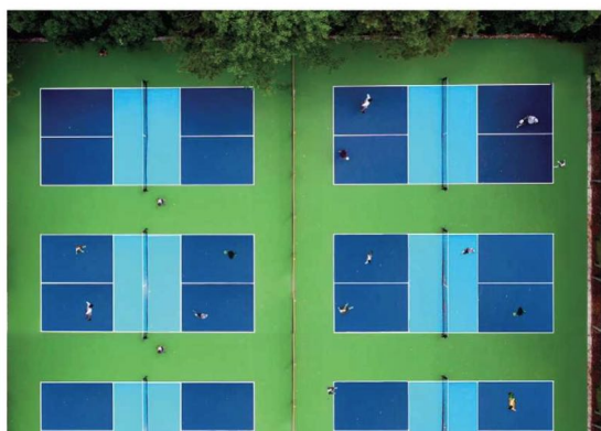
OCEAN EDGE RESORT & GOLF CLUB, CAPE COD, MASSACHUSETTS