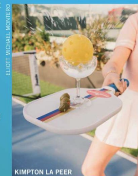
ELLIOT MICHAEL MONTERO

The hotel features 105 guest rooms and suites, a rooftop event space, poolside fitness center and more than 8,000 square feet of indoor and outdoor dining and lounge spaces.