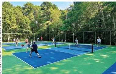
OCEAN EDGE RESORT & GOLF CLUB